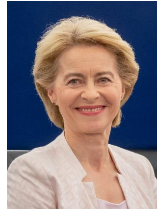
Ursula von der Leyen