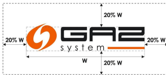
W – width of the logotype

The clear space surrounding the GAZ-SYSTEM logo, as shown in the accompanying illustration, highlights an area in which other visual elements must not intrude. The minimum of ??the clear space is at least 20% of the width of the character.